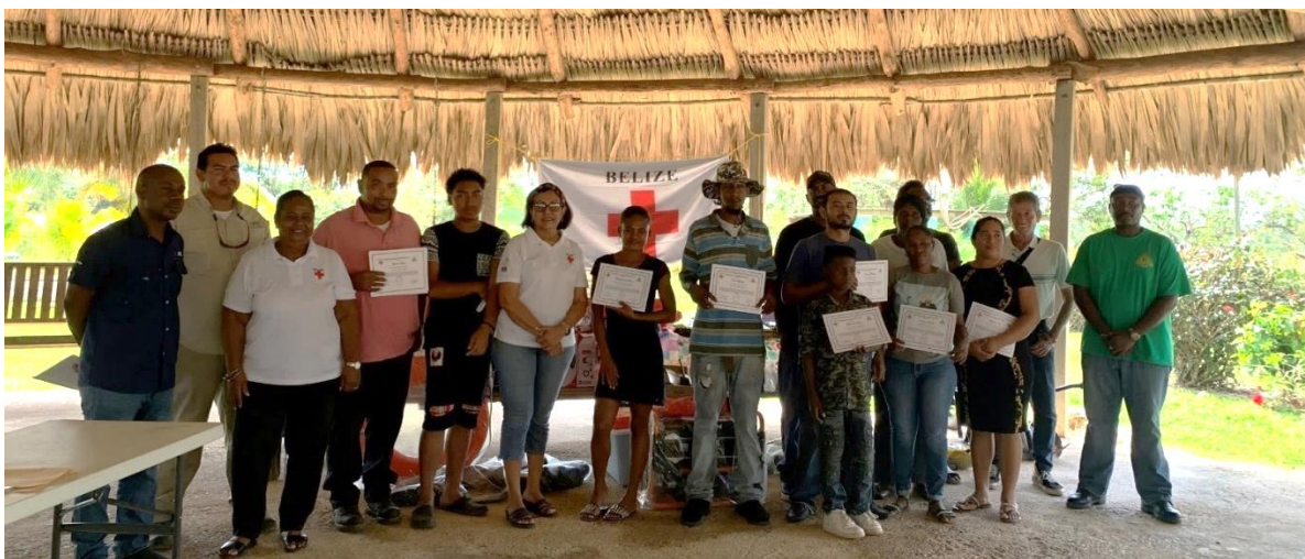
(Freetown Sibun CRDTs on Certification Day)