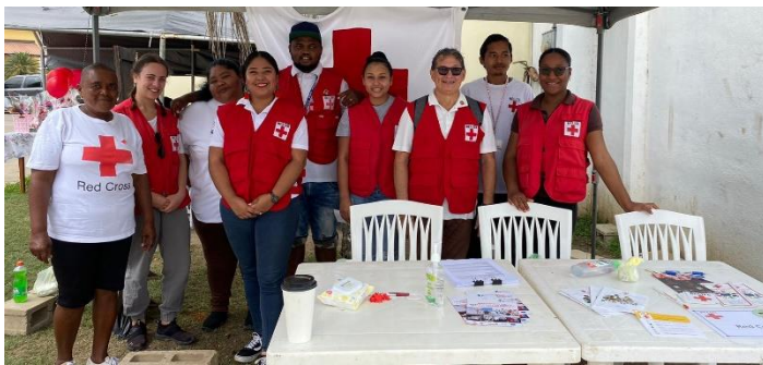
Volunteer Manager’s visit with San Ignacio Branch (above) and with the Corozal Branch (right)

A new Volunteer and Youth Development officer was recruited in August 2022 and since then branches have been meeting virtually monthly to share plans and discuss branch issues and finding solutions together. The Volunteer and Youth Development Officer also made a tour of the branches and met with several Branch Executive Committees to discuss branch plans and needs on a one-and-one basis. This helped to improve communication as well between Headquarters and the Branches. Branches benefit from various training opportunities and programs implemented within their jurisdictions.