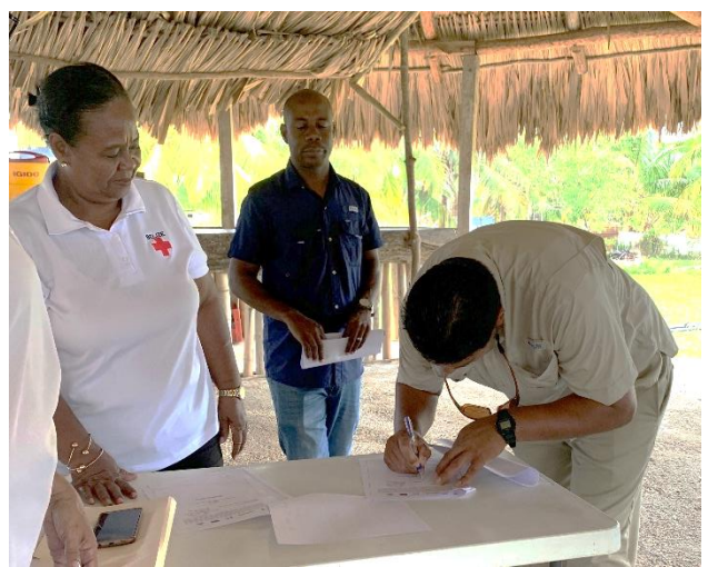
(Left presentation of certificate to the Village Chairperson; right signing for donated equipment)