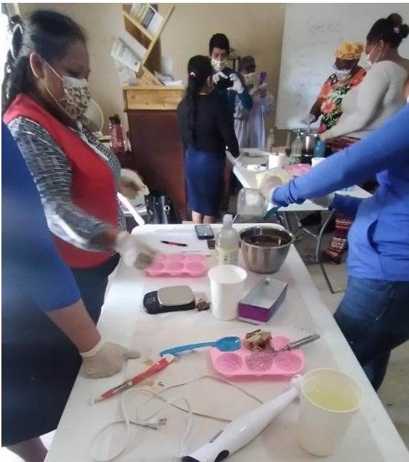
(Migrants learning soap making left)