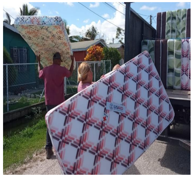
Staff & Volunteer conducting DANA