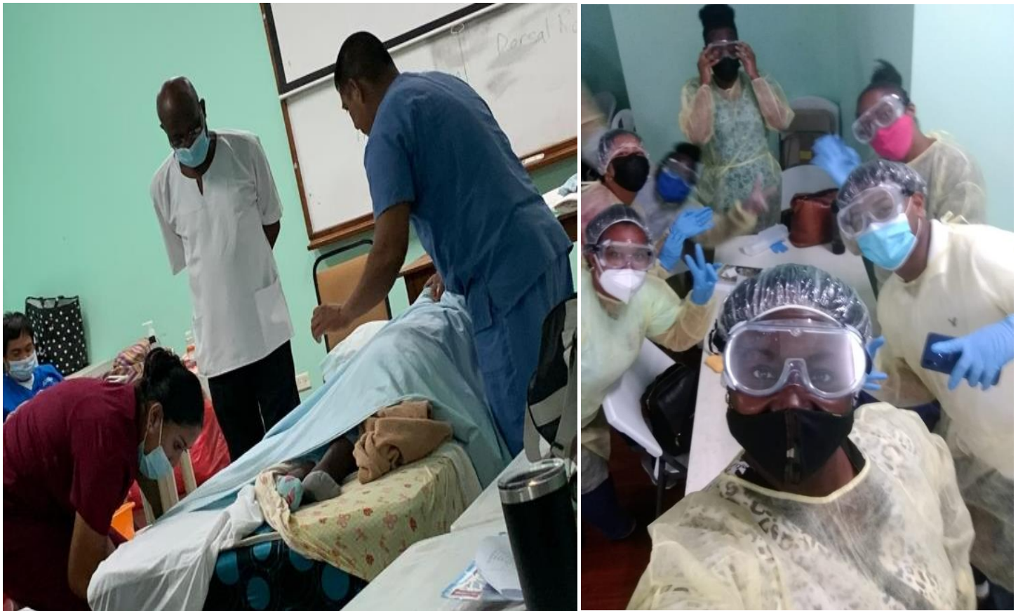
Home Care Givers (below) in training to care for bed ridden patients and the use of PPEs.

Output # 3.2: A National Society Health Policy is aligned to the IFRC’s Health Policy and is in line with Belize’s National Health Policy and includes Mental Health and Conflict Management.