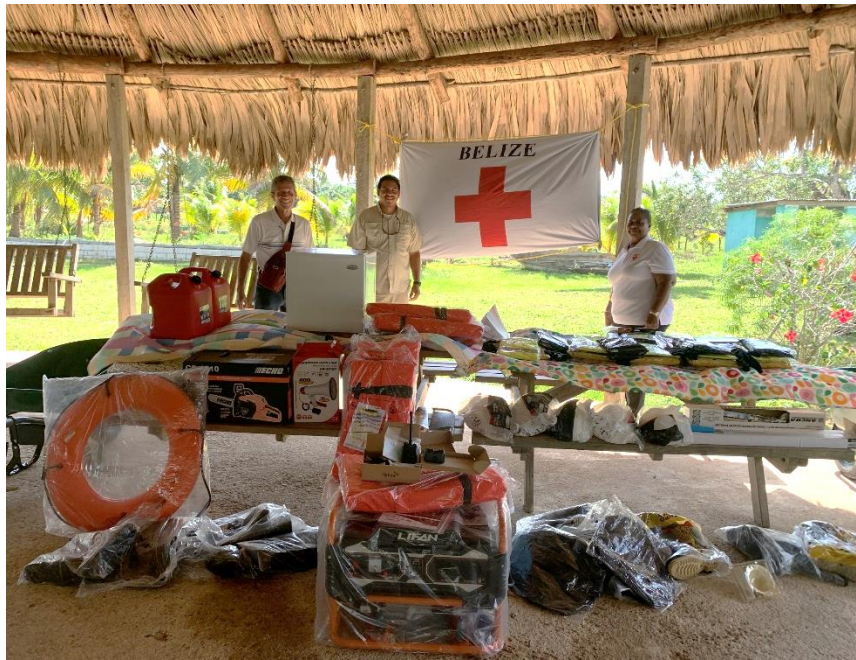
(Equipment donated to the CDRT)