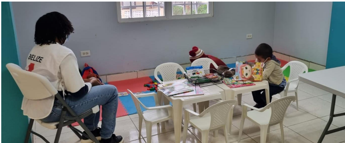
(Youth volunteer managing child friendly space during cash distribution)