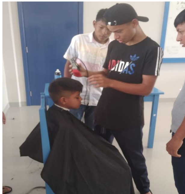
(Migrants learning barbering below)