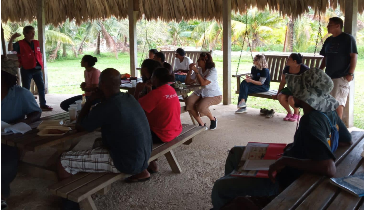
(CDRT training in session during the visit of ECHO monitoring visit)