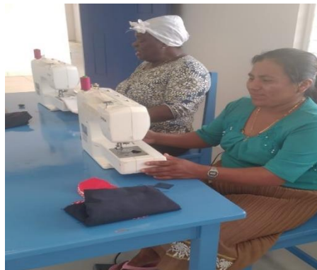
(Migrant ladies learning to sew right)