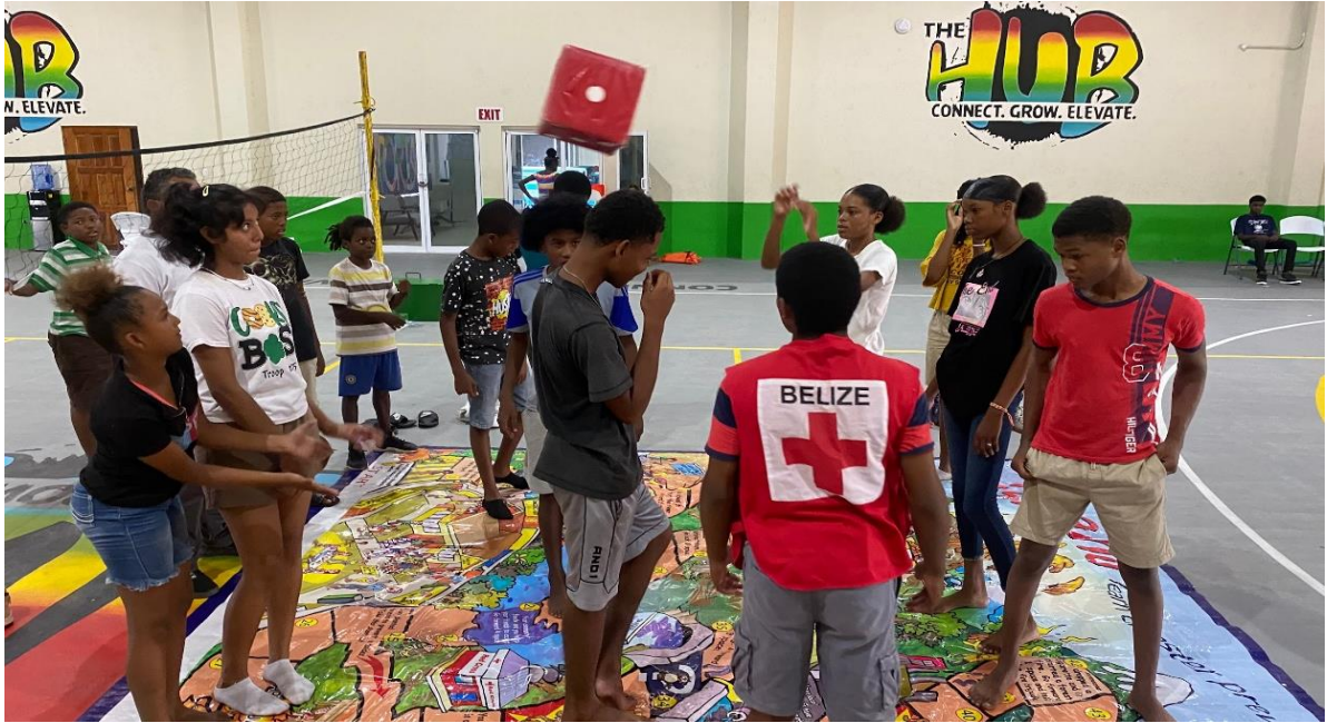
(BRC Volunteers assisting at summer camps – Disaster Preparedness game)

Output # 5.2: BRC Migration Hub at the San Ignacio Branch facilitates information sharing and guidance for migrants in partnership with IOM through their IRM and WHP programs.