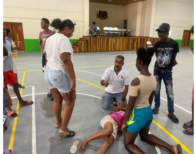
National First Aid Coordinator training youths at the Summer Camp in Belize City