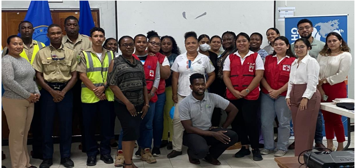
Participants at the Psychosocial Support Training by PAHO