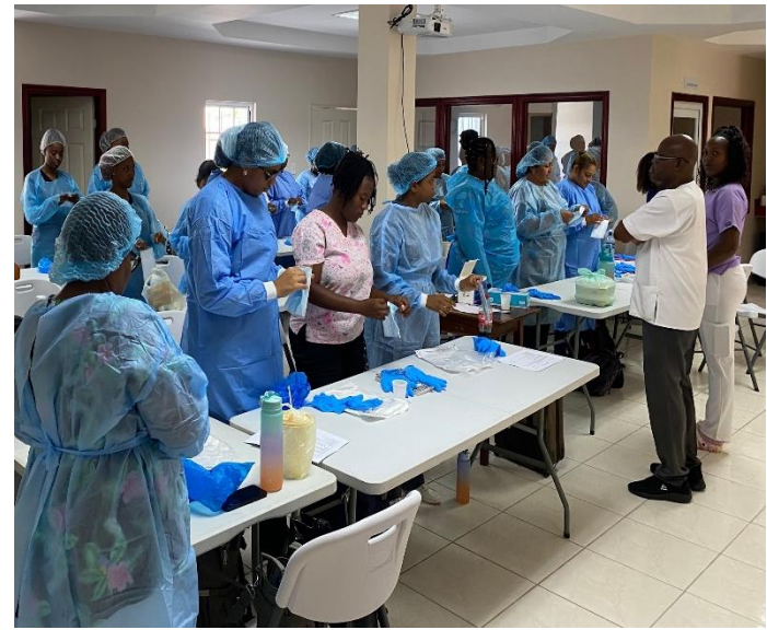
Duffing, Dunning and Vital sign checks being practiced by the Home Caregivers