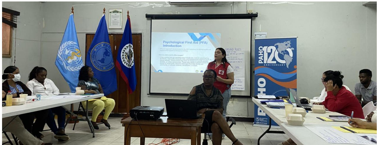
Volunteer conducting teach-back session