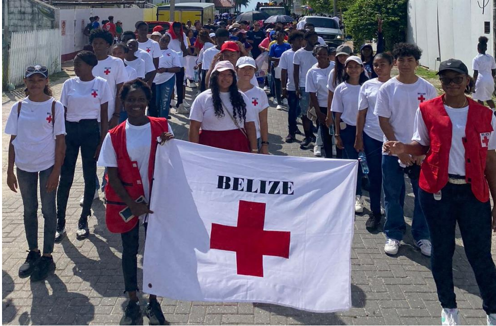
SCA Youth Group at the Independence Day Parade