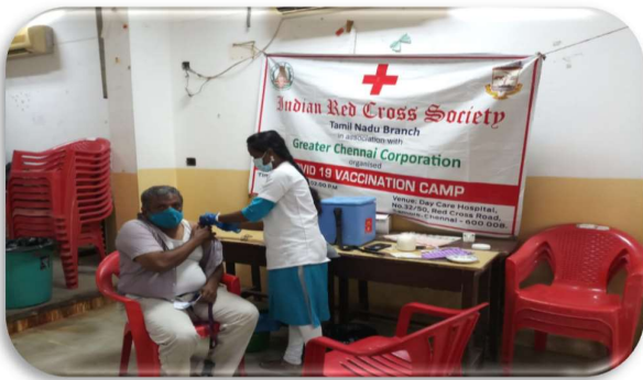
Vaccination drive, Tamil Nadu

IRCS also considerably stepped up and scaled up its health response in clinical services and preventive services in response to the crisis and assisted the MOHFW in the logistics of procuring essential medical equipments and supplies. IRCS also initiated several approaches to adapt to the new constraints of aid delivery including, mobile blood donations and COVID-19 testing. The Ministry of Health and Family Welfare had established a cell comprising representatives from the Ministry of External Affairs (MEA), Customs, Ministry of Civil Aviation (MoCA), HLL, National Disaster Response Force (NDRF), Department of Military Affairs (DMA) and IRCS to facilitate humanitarian aid donations from foreign countries to the Government of India.