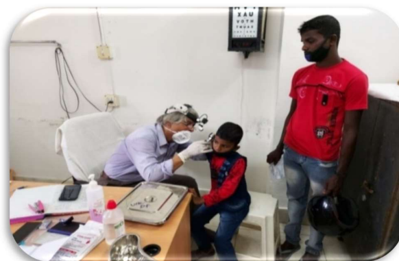
Multispecialty health camps at Port Blair, South Andaman

The participants were also trained on the basic principles and practice of first-aid, assessment in first-aid, basic life support, safe handling and transportation of patients. Andaman & Nicobar UT branch also conducted three blood donation cum motivation camps with support of the blood bank, G.B Pant Hospital, Port Blair, South Andaman. 3 multi-speciality health camps were also conducted in South Andaman district and a total of 753 patients were benefited.