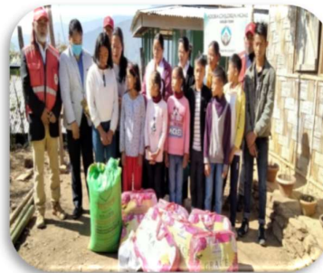
Visiting Adore Children Home Noklak