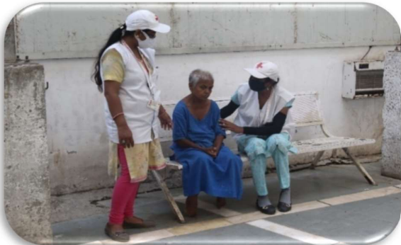
Providing mental support to Corona patient, Faridabad

IRCS was involved in supporting vulnerable affected persons in different ways, including restoring family links (RFL), helpline services, etc.