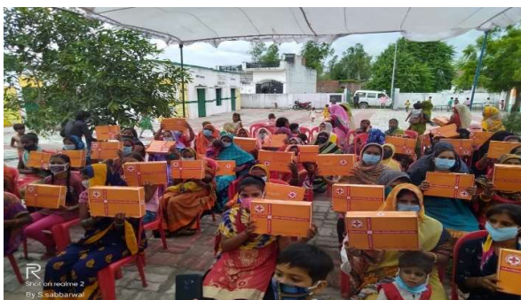
Distribution of Hygiene Kit, Uttar Pradesh