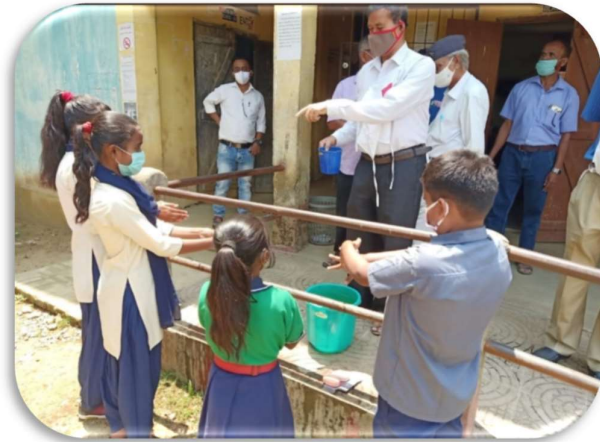
Awareness on Best practices of Hand Washing, Assam

Indian Red Cross Society scaled up preparedness & response to tackle the Corona pandemic by initiating a myriad of awareness activities and distribution of IEC materials in local languages, distribution of personal hygiene items, food and dry ration packs, community surveillance and community counseling, logistic support to quarantine & isolation centres, establishing connection with families of migrants and providing shelter homes to them, ambulance and transport services for patients, disinfection of public places, installation of pedal sanitizers & hand-washing kiosks; home delivery of food and medicines to patients with chronic diseases, pick-up and drop-off facility to individual blood donors, mobile blood collection, 24/7 control room for blood requirements and psychosocial support etc.