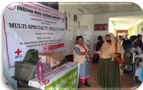
Multi-Specialty Health Camp under SERV Scale up Programme