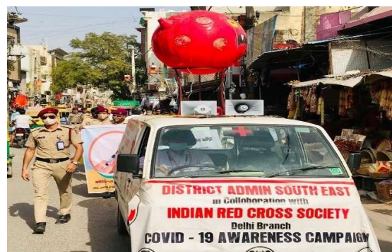
Covid-19 Awareness drive, Delhi