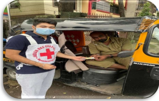
Youth Activity, IRCS, Maharashtra