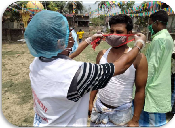
Awareness on wearing mask, West Bengal

COVID-19 is an infectious disease caused by a new virus named SARS-CoV-2. On 30 January 2020, following the recommendations of the Emergency Committee of the WHO its Director General declared that the COVID-19 outbreak constitutes a Public Health Emergency of International Concern. The first case in India was confirmed on 30 January 2020. After a period of low activity, cases started increasing gradually. By early to mid-March 2021, the government had drawn up plans to deal with the threatening outbreak in the country. Covid cases galloped in US and several European countries. There was global turmoil and medical facilities started crumbling wherever positivity rates were high. The spread was fast and furious.