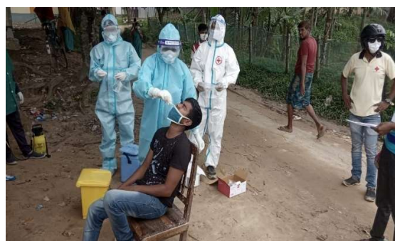
Corona Testing, Tripura