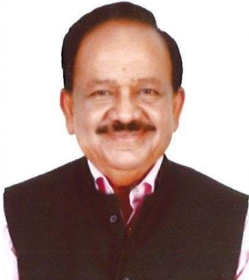
Dr. Harsh Vardhan Our Hon'ble Chairman