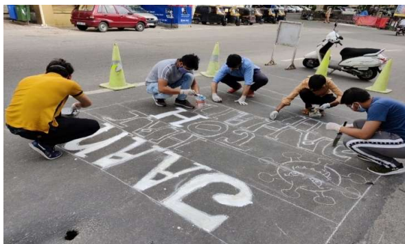
Covid- 19 Awareness drive by street painting, Jammu

Training webinars for volunteers and staff were held and guidelines for safety of staff and volunteers were issued. IRCS branches continued their efforts throughout 2020 slowly relaxing as the number of cases subsided towards the end of 2020 but scaling up as the number of cases started to rise in early 2021.