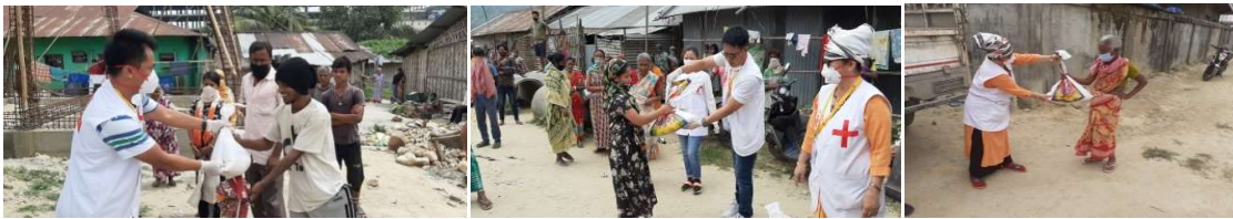
At Helipad Colony (from left) Har Ek Maal colony and Iekhi, Arunachal Pradesh.

Phase 3- Distribution of rice, dal and salt at Colonies of Naharlagun to the poor and the needy was held by Executive members and Volunteers of IRCS From 29 th April to 2 nd May,2020. Hand sanitizers, masks & food items were distributed to the poor and the needy at various colonies of Itanagar.