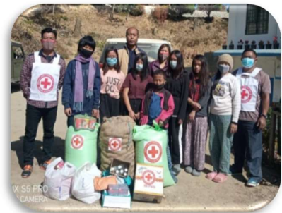
Relief to Children home Peren