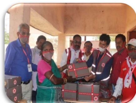
Distribution of Hygiene Kit, Odisha

Amid unprecedented surge in the number of Covid-19 cases across India, the global community, which included Govts. of several Countries, Partners National Societies, IFRC, ICRC, Association of Indians leaving abroad & People of Indian Origin (PIO), have extended a helping hand in cash and kind and supported the efforts of the country in its fight against the pandemic.