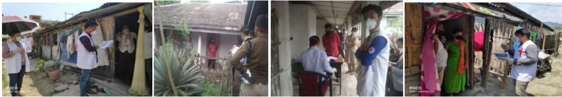
The Volunteers of IRCS, APSB giving door to door awareness on COVID-19 cum awareness and tracing out the quarantined at Helipad (left), Miya and Prem Nagar colony of Naharlagun, Arunachal Pradesh.

Phase -1 Tracing out the Quarantined, Stranded Students and door to door awareness cum counseling on Covid-19 pandemic,2020, from 31 st March to 9 th April 2020: The Volunteers of IRCS, APSB were assigned the task of tracing the home quarantined persons assisted by District Medical Officer, Capital Complex in Naharlagun, Itanagar and Banderdewa, maintaining social distance.