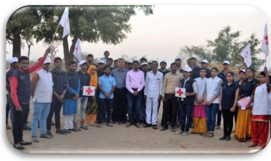
Youth Activity, IRCS, Gujarat