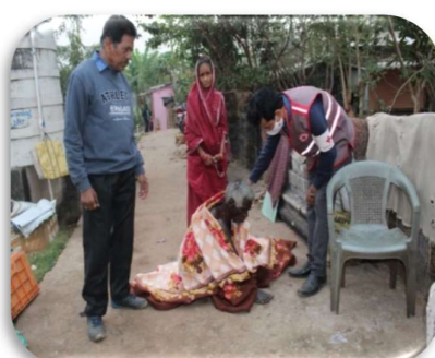
Distribution of Blanket, Odisha