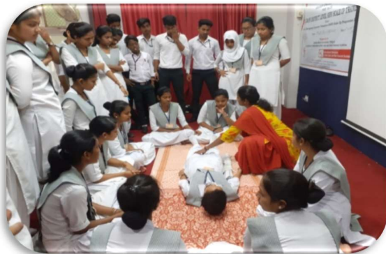
03 Days Volunteers Level Training at Port Blair, South Andaman

The Social and Emergency Response Volunteer (SERV) Programme is designed to build community resilience through training of the target group by Master Trainers, Instructors and SERV volunteers on a pan India basis. SERV volunteers impart health and disaster related messages apart from leading social campaigns in the community. They are at the fore front as first community responders in case of any disaster etc.