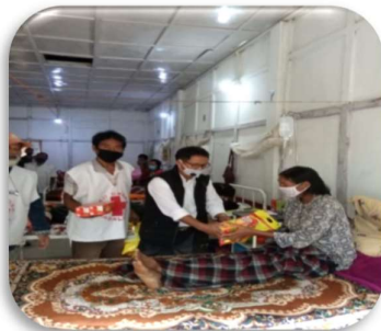
Visiting sick patients in hospitals

➤ The district branches undertook many humanitarian activities to various establishments, in addition to their routine COVID responsibilities