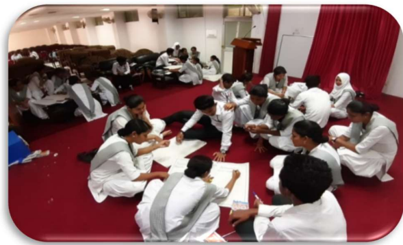
03 Days District Level Training of SERV Scale up Program