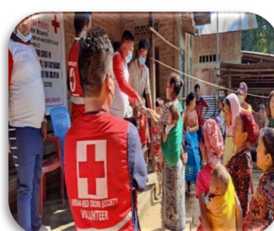
Distribution of Hygiene kit, Manipur

Medical equipments, Personal protective suit (PPE), masks, gloves, sanitizers, face shield, food supplement etc. were being continuously donated by Domestic & International donors. Some of the major donors who donated in Kind during this period included French Govt., Govt. of Vietnam, Vietnam Red Cross, IFRC, ICRC, UAE, USAID, M/s TECC, HLL, M/s Ali Baba Foundation, M/s Temasek Foundation, M/s Taipei Economic & Cultural Centre, M/s KAB Welfare Foundation, State Bank of India etc.