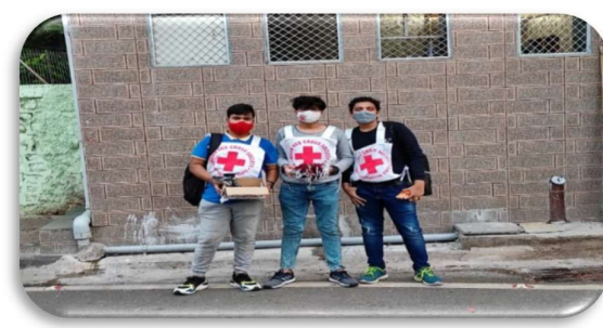
Youth Activity, IRCS, Assam