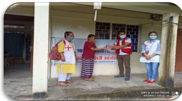
Principal Abotani Vidya Niketan,Pachin Colony & Govt.Middle School Popu-II. 22.09.2020.