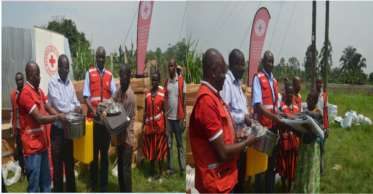
URCS Secretary General (M) handing relief items to the flood affected victims in Bundibugyo.