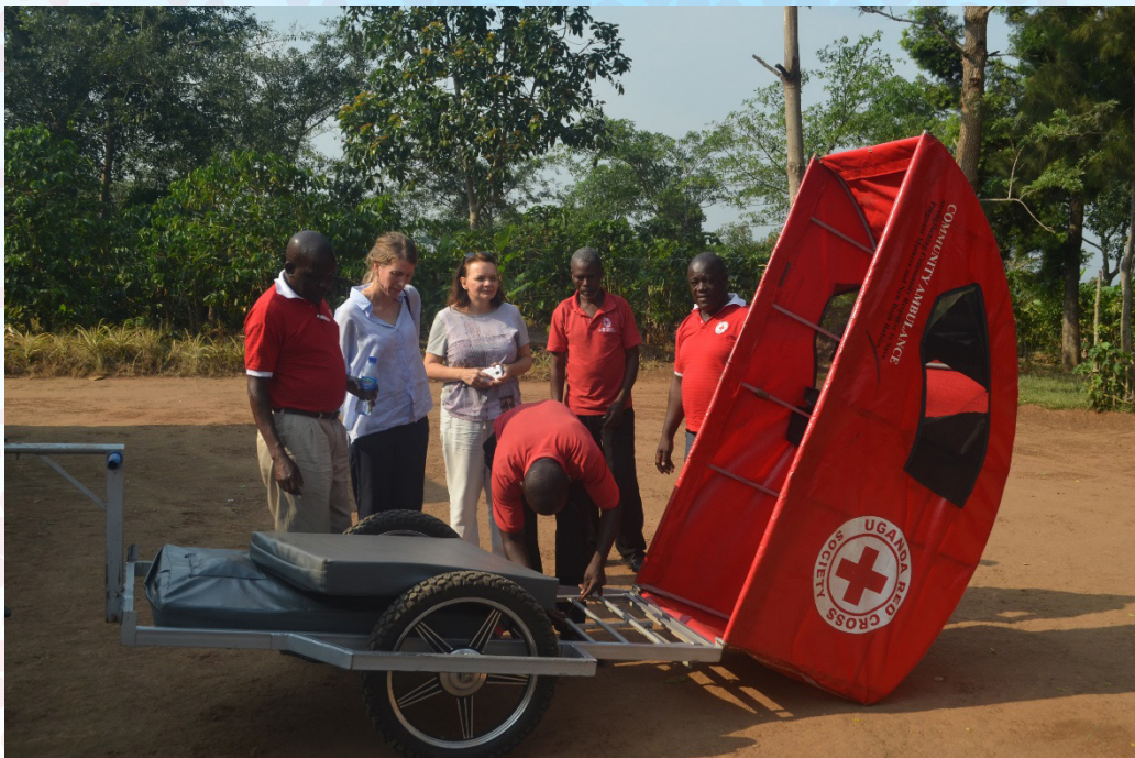
Sample motorcycle ambulance advanced to health facilities in rural communities to support pregnant mothers to access health facilities with ease.