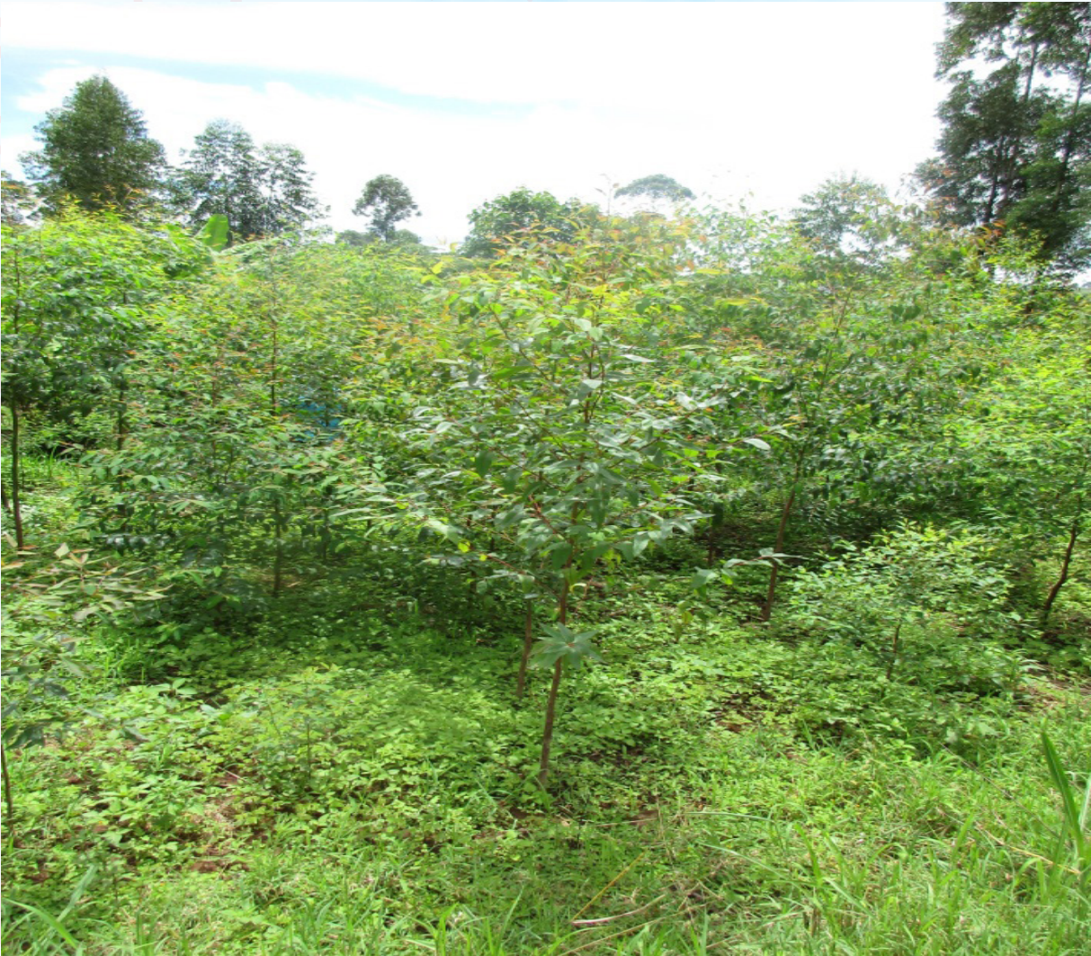
Some of the trees planted at one of the community sites.