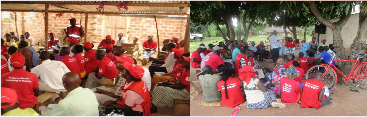
Trainings in progress