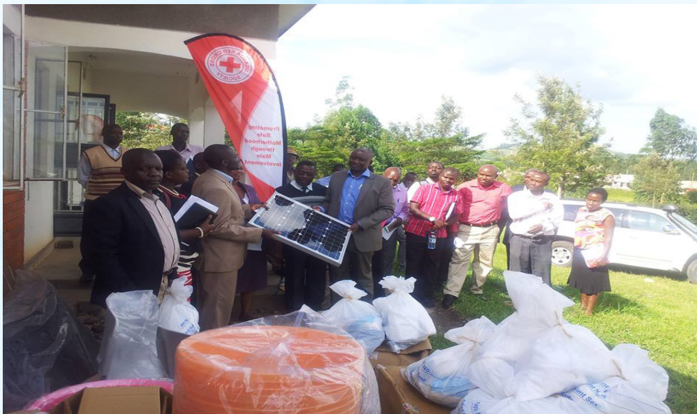
Uganda Red Cross Secretary (R) handing over materials to support Kamulegu health