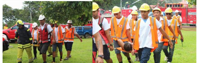
Community First Aid Service – Saving Lives – Changing Minds