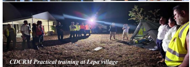
CDCRM Practical training at Lepa village