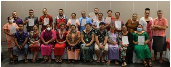
Working Committee and Facilitators of CSE/FLE Program in Samoa

SRCS participated collaboratively with their local partners in celebrating, 16 Days of Activism, 2023.